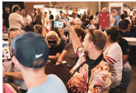
Contest judging was well attended on the last day of the Iowa State Fair on Aug. 21, 2022.